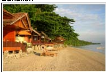
Hotel in Bunaken

the local woman makes complicated pattern on their weavings. Around 04:00 PM we will proceed into the river bank of Lake Tempe. We will hire local fisherman motorized canoe and we will visit the fisherman floating village in the middle of the lake. You will have coffee or tea with fried banana at one of the floating house while observing the way of life of the villagers. By sunset we will proceed back to Sengkang and on the way you will enjoy spectacular colour of sunset. Lake Tempe is also rich with birds and you can see them well by sunset.