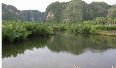
Karts, South Sulawesi