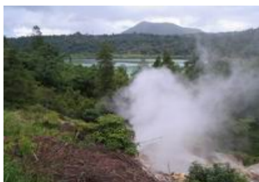
Lake Linow, Manado