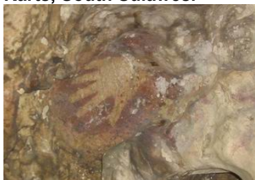
Karts, Prehistoric painting