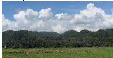
Karts, South Sulawesi