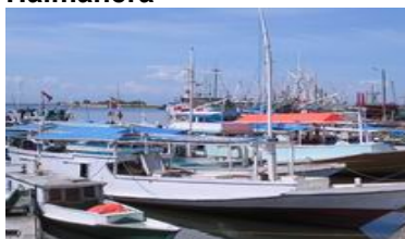
Paotere Anchorage, Makassar