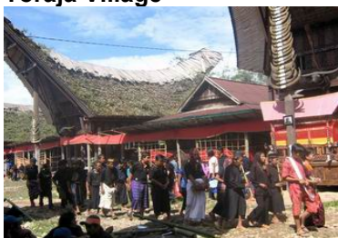
Toraja, a funeral ceremony