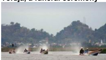
Boat, Lake Tempe Sengkang